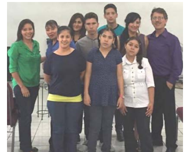
Our Casa Del Rey Family, El Moral.