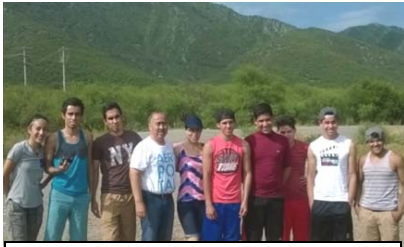
God bless our Casa Jovenes Del Rey family (Boys' home in Piedras Negras).