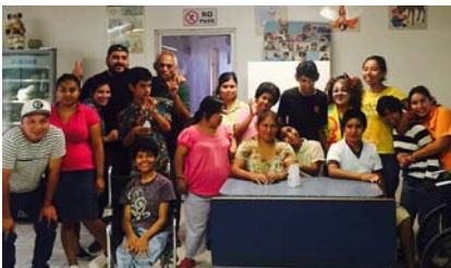
We expect to deliver gifts to the home for the disabled and mentally challenged located in Piedras Negras.