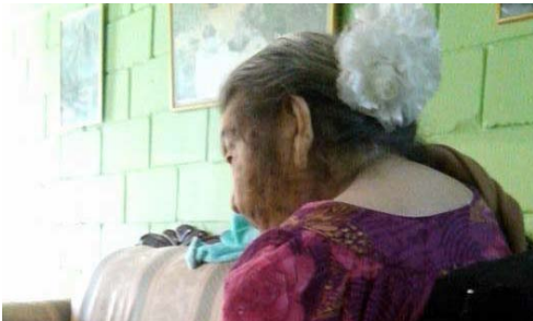
We minister to the elderly and the disabled.