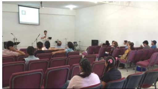
Health maintenance classes for the public are held in Iglesia Pacto de Paz and other locations.