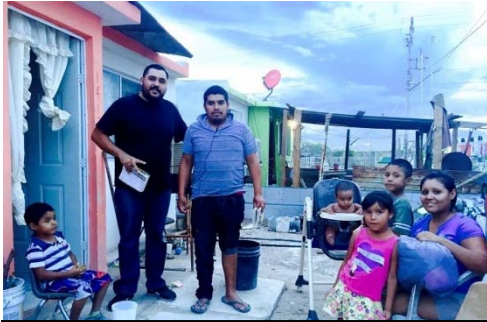
Families are blessed.