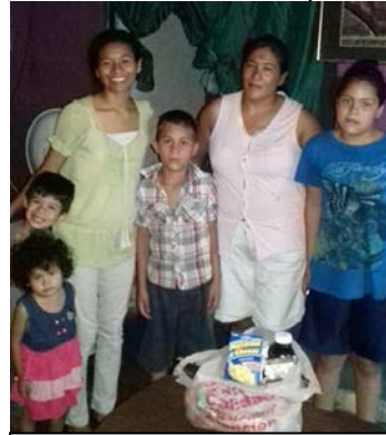
Fabiola ministers to local families